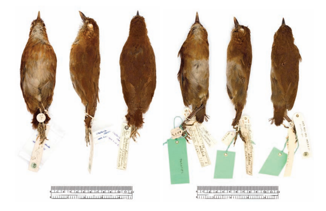
Figure 2. The Grallaria\ m.\ gilesi holotype (left three images) and Grallaria\ m.\ milleri paratype (right three images).