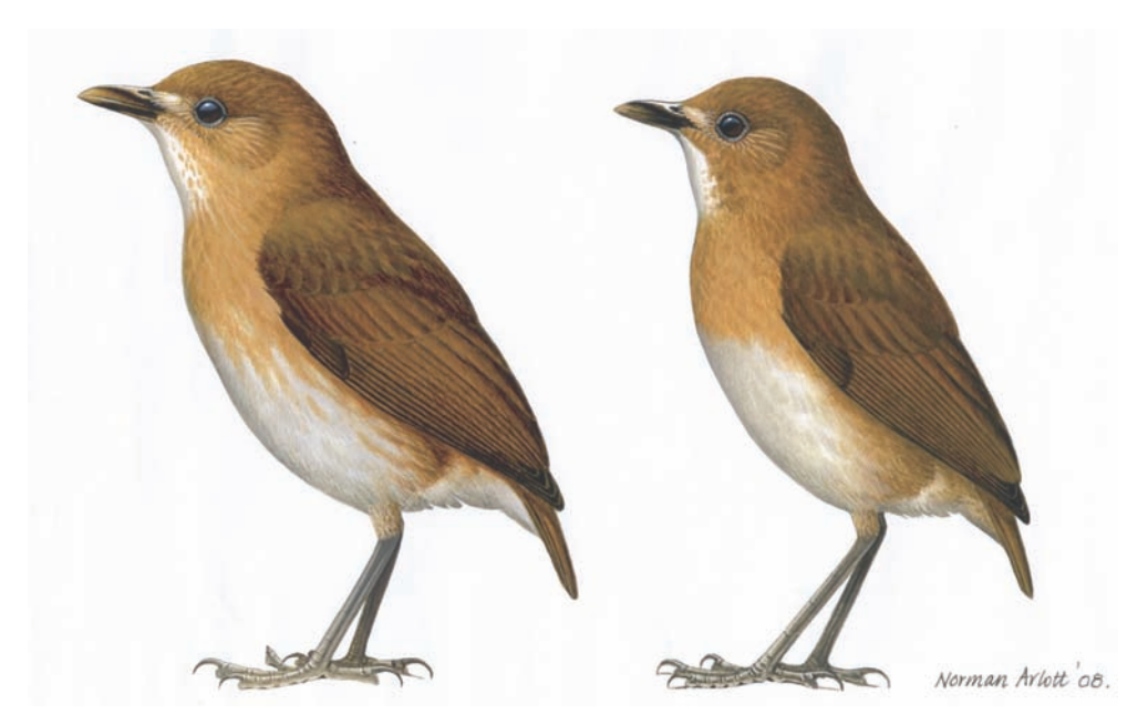
Figure 1. Plate by Norman Arlott showing Grallaria m. gilesi (left) and Grallaria m. milleri (right).